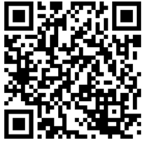
Plate offerings are the funds collected during the services of our church. They are a way that our gratitude and generosity make incarnate the mission and ministry of God as lived through St. Margaret's, for local ministries as well as community, diocesan and international ministries. To give a gift now to the ministries of St Margaret's, you may put cash or checks in the collection plate by the entrance to the church or you can scan the QR code at the left with your mobile phone. THANK YOU!